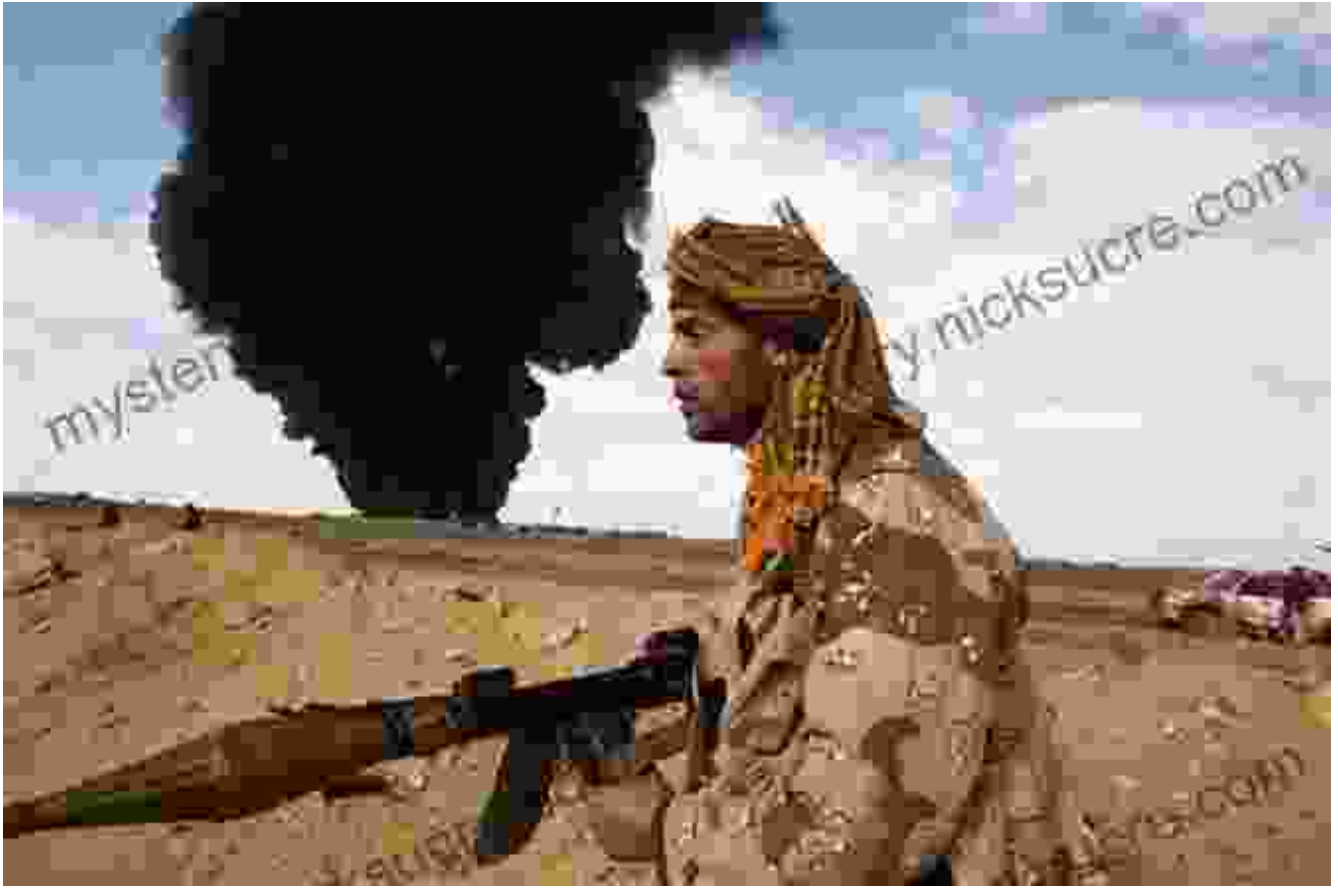
A Libyan rebel fighter fires a rocket-propelled grenade during the Battle of Tripoli in 2011.