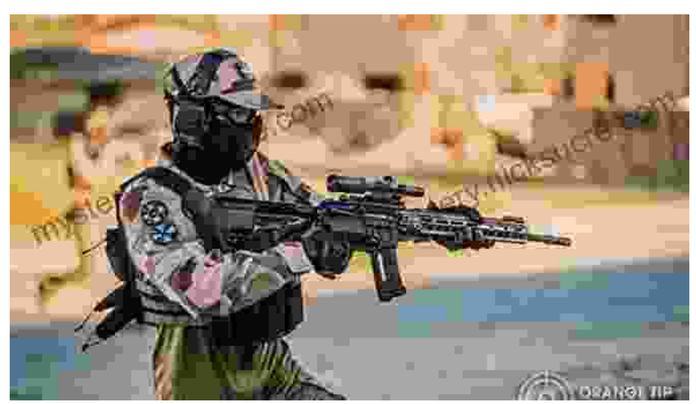
Paintball Scenarios: Excitement and Teamwork

Paintball, with its vibrant paint projectiles, provides an exhilarating and colorful experience. Scenarios in paintball focus on teamwork, communication, and quick reflexes.